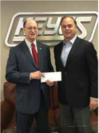
Grassroots advocacy meetings with elected officials at the local, state and national level, are crucial to fulfilling the mission of serving all the GLANCD A Dealer members.