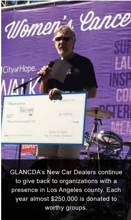
GLANCD A's New Car Dealers continue to give back to organizations with a presence in Los Angeles county. Each year almost $250,000 is donated to worthy groups.