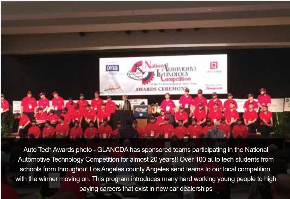
Auto Tech Awards photo - GLANCD A has sponsored teams participating in the National Automotive Technology Competition for almost 20 years!! Over 100 auto tech students from schools from throughout Los Angeles county Angeles send teams to our local competition, with the winner moving on. This program introduces many hard working young people to high paying careers that exist in new car dealerships